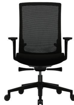
Office chair Ergo (black)