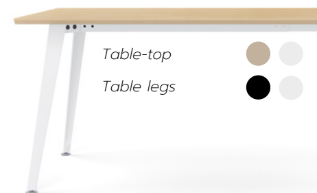
Table-top Table legs