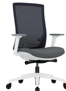
Office chair Ergo (gray/white)