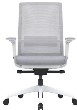
Office chair Active (gray/white)