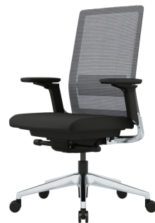
Office chair Active (black)